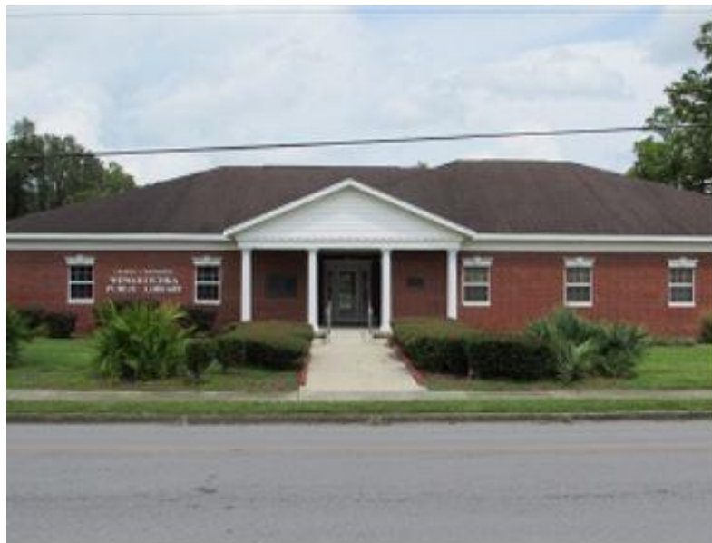
Charles Whitehead Public Library