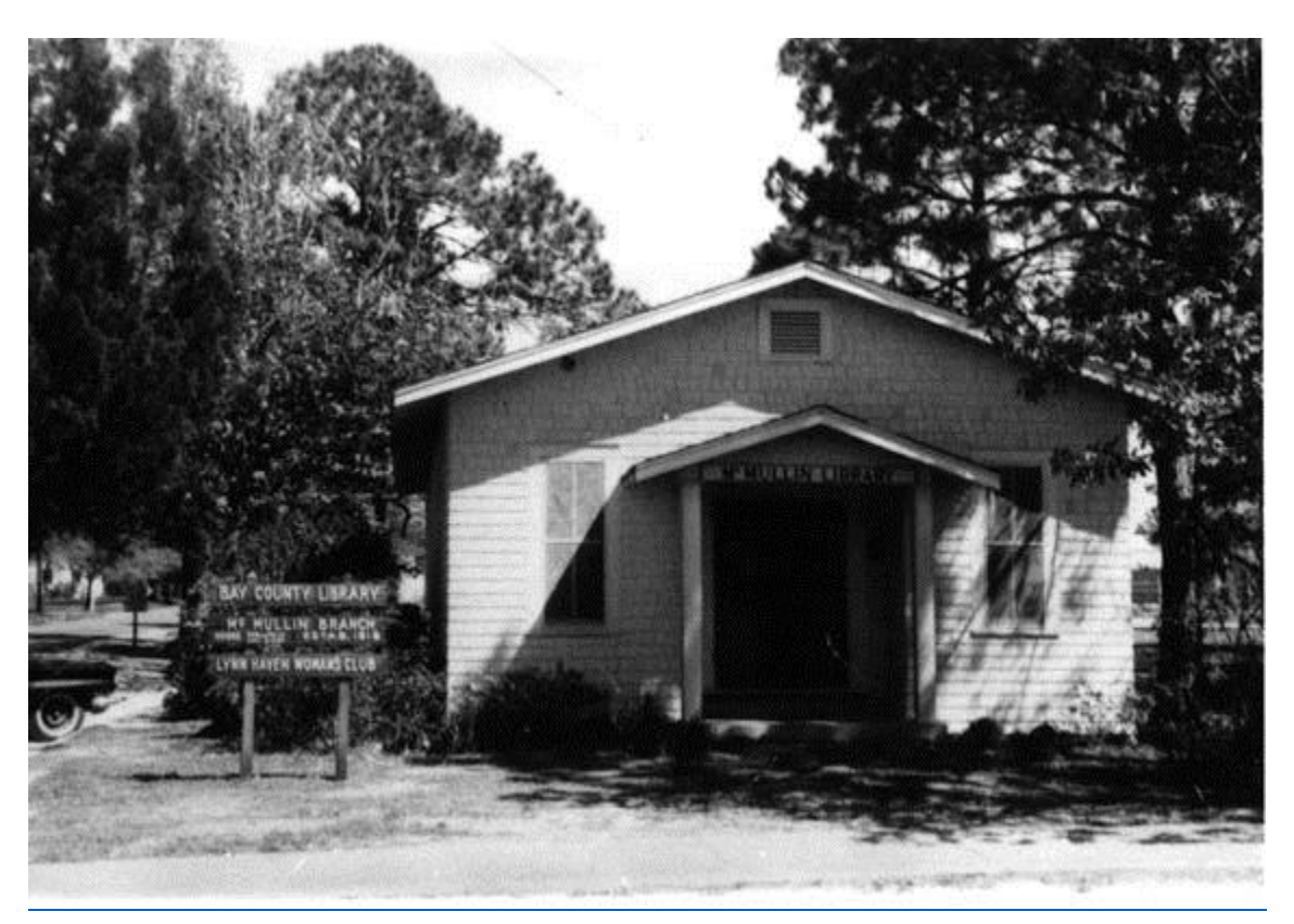
McMullin Branch of the Bay County Library located in Lynn Haven

"Public libraries are an essential part of a complete educational system...Society is required to educate the man of forty just as much as the boy of five...The library helps workers do their work...The library furnishes rest, relief and recreation for tired workers...The public library helps make intelligent citizens...By its cooperative principle, the library makes one dollar do the work of many."