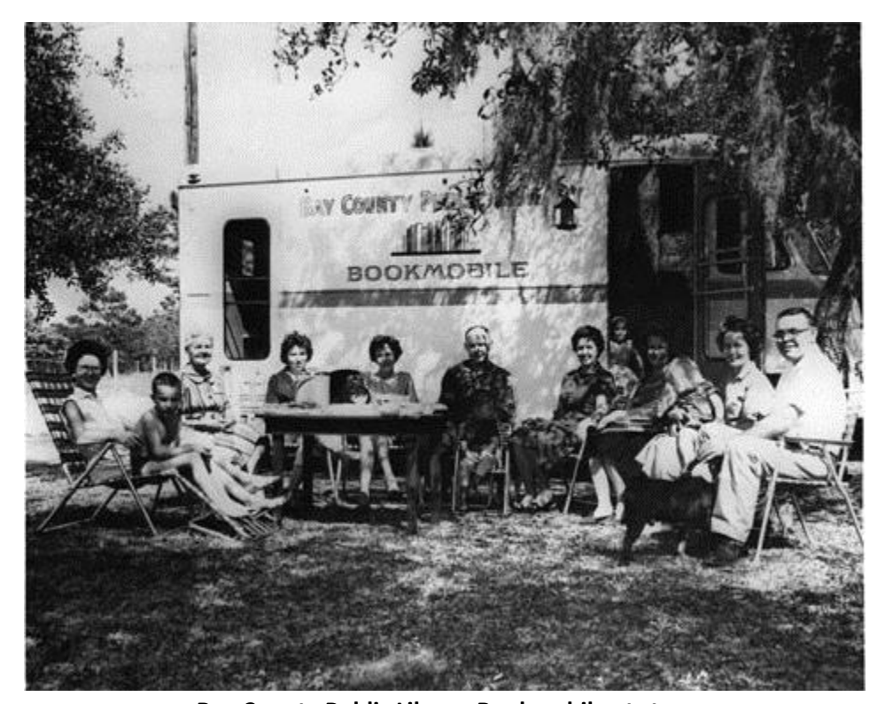
Bay County Public Library Bookmobile at stop.

By 1960, the library had almost doubled its services. We had a bookmobile and the McMullen Library in Lynn Haven became a part of the county system. In September 1960, the Bay County Free Public Library was incorporated as the Bay County Public Library Association, Inc. The Association contracted with the Bay County Board of Commissioners to provide library services to our citizens. In 1962, the library purchased a second bookmobile and the Association contracted with Washington County and formed the Northwest Regional Library System.