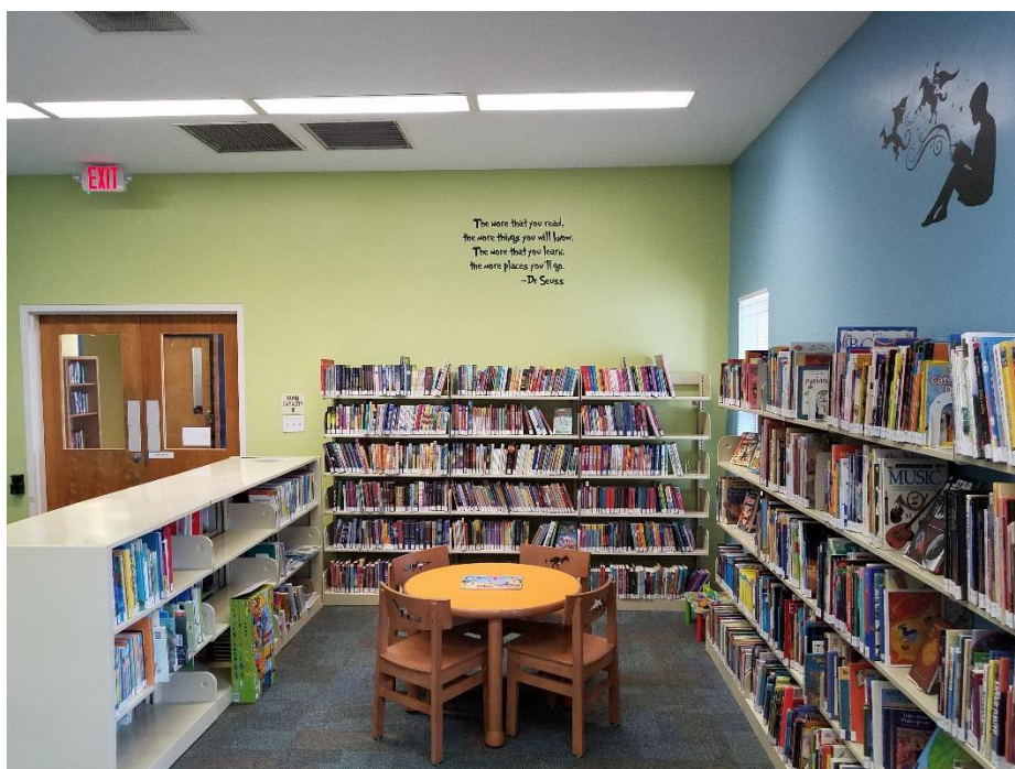
Renovated Parker Public Library after the Hurricane Michael repairs.