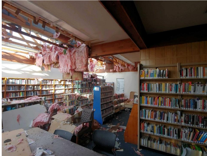
Interior of the Parker Public Library after Hurricane Michael (October 10, 2018)

Hurricane Michael hit the Bay County area on October 10, 2018. The Parker Public Library had the most damage from the hurricane and lost a large portion of its roof causing 4,000 books and other materials to be destroyed. While the library was being repaired, a bookmobile was loaned by the Rotary Club of Chesterland Ohio to be able to provide library services to the Parker Community.